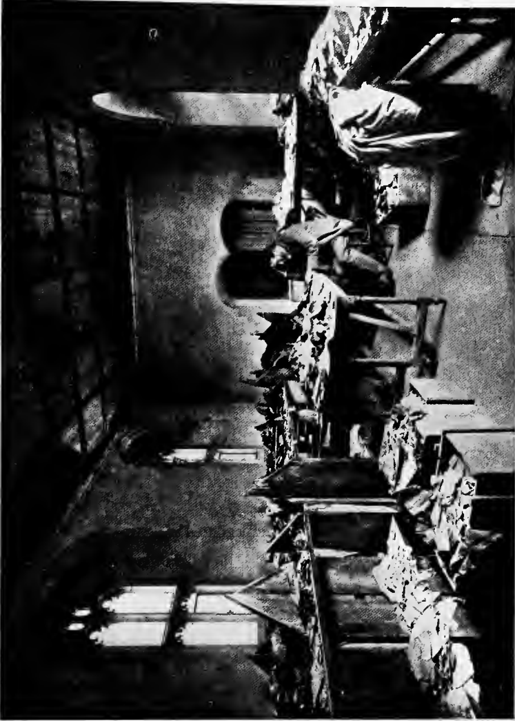
SCHECHTER-TAYLOR CAIRO COLLECTION, UNIVERSITY LIBRARY, CAMBRIDGE, ENGLAND.